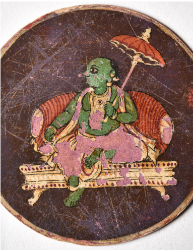
The Dwarf Avatar