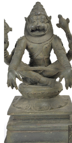
The Lion Avatar