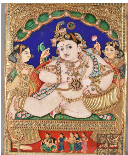
The God of Compassion, Tenderness and Love