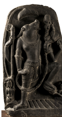
The Boar Avatar