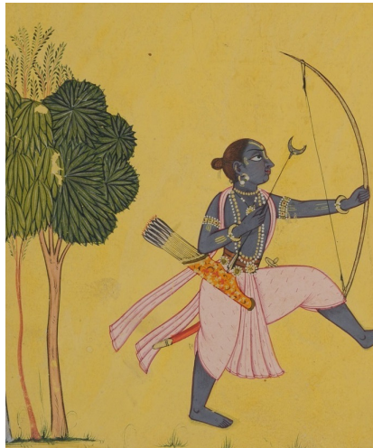
Slayer of the demon king Ravana