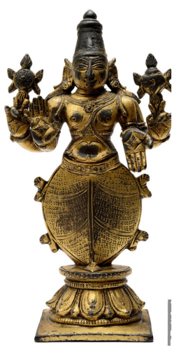
The Tortoise Avatar