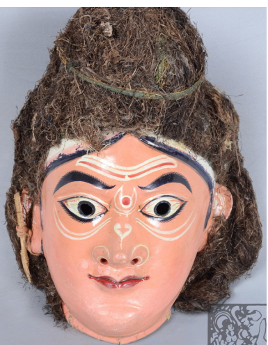
The first Warrior Brahmin