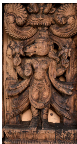
The Last Avatar