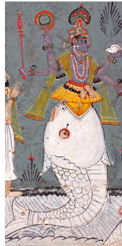
The Fish Avatar