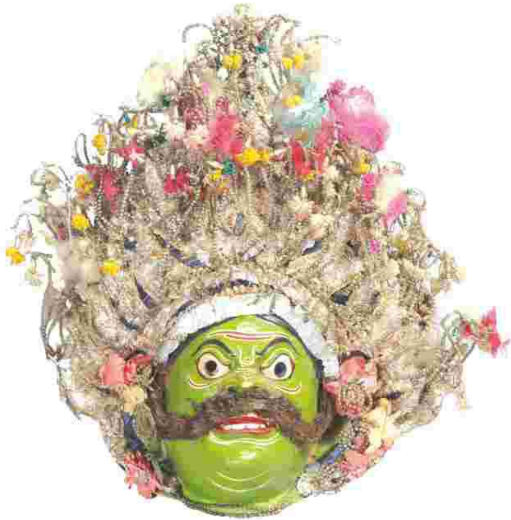
INDRAJIT ( Chhau mask )

West Bengal 20 th century Papiermache; painted Lt. 49 cm (approx.) Acc.no. 72.40