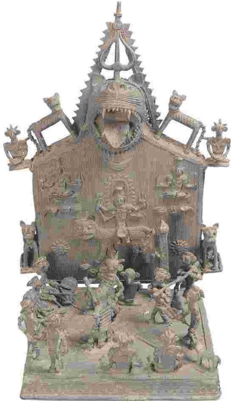
Madhya Pradesh 20 th century Bronze; casted Ht. 41; Lt. 23; Wd. 22 cm Acc.no. 96.101