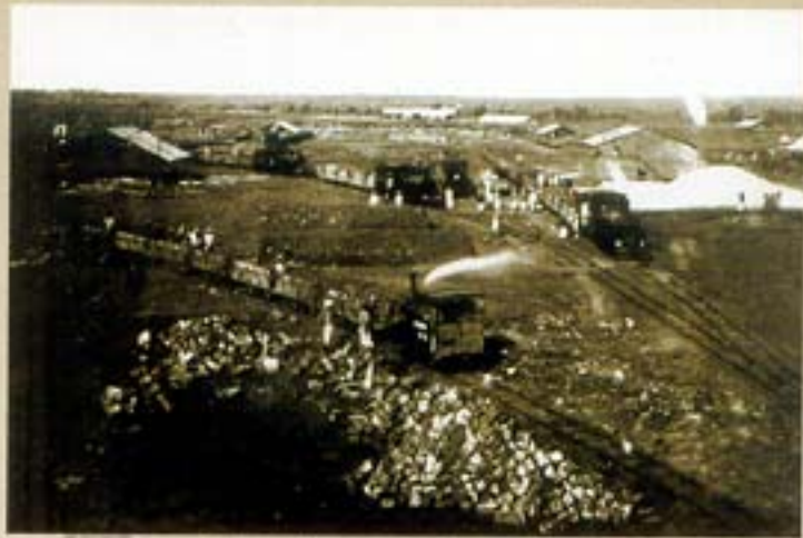
Transporting construction material to the site at Raisina Hill.

designing the city of Delhi and Government House, which later came to be known as the Viceroy's House (Rashtrapati Bhavan). Sir Herbert Baker was commissioned to design the two wings of the Secretariat (North & South Block) and Council House (Parliament House).