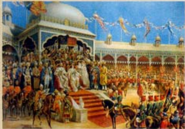
Coronation Durbar, 12th December 1911.

D elhi, one of the oldest cities in the world, and the favoured capital of several dynasties is a legend in architectural style and design. Each stone tells a story, each structure is a tribute to a glorious heritage.