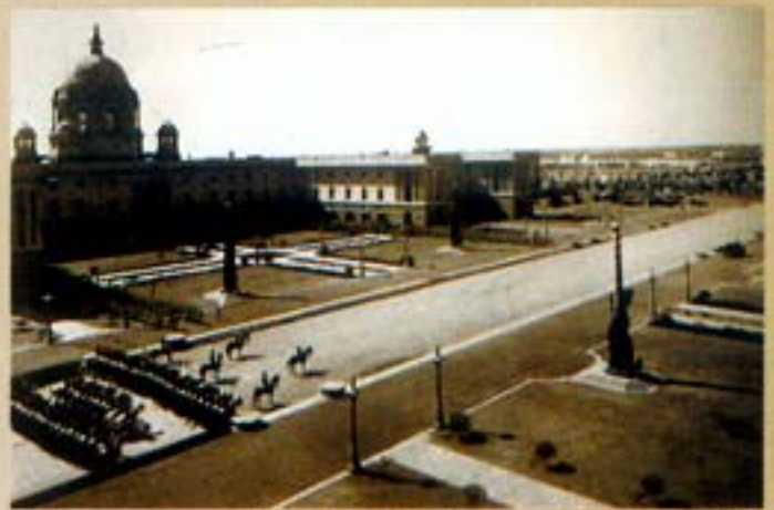
View of the official ceremony, 10th February 1931.

Adjacent to the North Block is the circular colonnade, Parliament House with a road leading to Connaught Circus and carrying on along the ramparts of Shahjahanabad till the Jama Masjid. The plan of the site is based on two crossing axes The King's Way (now Rajpath) and Queen's Way (now Janpath) and radiating axes, one of which links the Parliament House through Connaught Place to Old Delhi. At the head of the King's way on a hillock, the Raisina is the Viceroy's House (now Rashtrapati Bhawan).