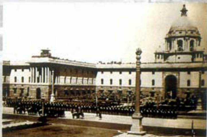
A view of Indian spectators on the roof of North Block, 10th February 1931.

The secretariat buildings convey an ethereal lightness as also stately grandeur fusing together the traditional Indian and the modern English styles of architecture. The North and South blocks showcase the characteristic features of Indian architecture: the open canopies, chhatris, overhanging eaves and balconies or chhajjas and the intricately carved stone and marble lattice screens or jalīs. Sandstones of the high plinths and the Dholpur stones for the walls and pillars add to the magnificence of these buildings. The decorative-art work in the Secretariat