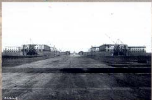
North & South Block under construction.

Keeping these objectives in view, the New Delhi Planning Committee was constituted in 1913. The responsibility for the construction of important buildings of New Delhi were given to Sir Edwin L. Lutyens and Sir Herbert Baker. Lutyens took up the challenge of